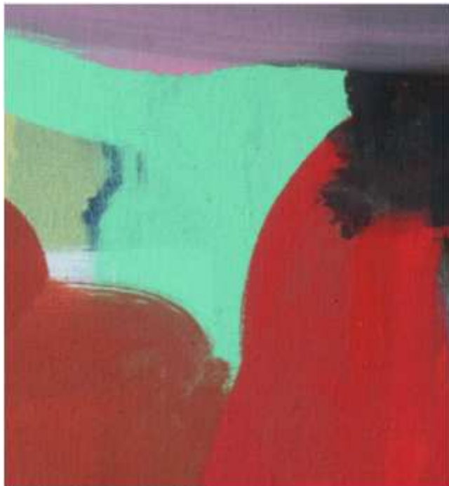
Marc Van Cauwenbergh, Spaso , 2013 huile/tin, 51x38 cm, détail