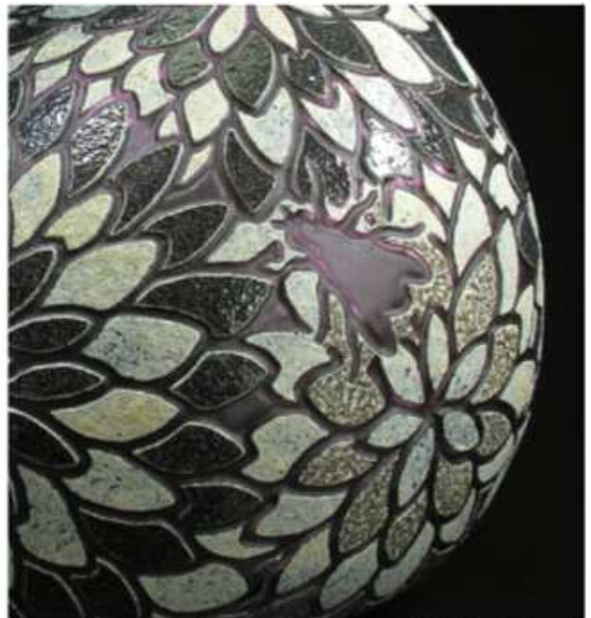
Gérald Vatin, Pâquerette , n°226-11, 2011 verre soufflé, émaillé et gravé, 102cm, détail