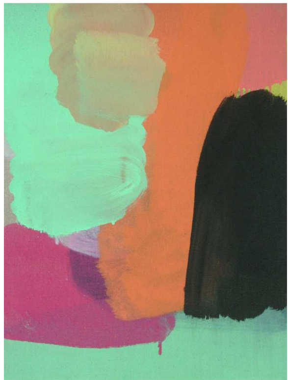
De g. à d. : Mariana et Eventail , oil on canvas, 20x15 inch.