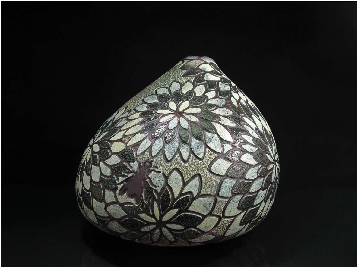
Passiflore and Pâquerette, handblown and engraved glass.