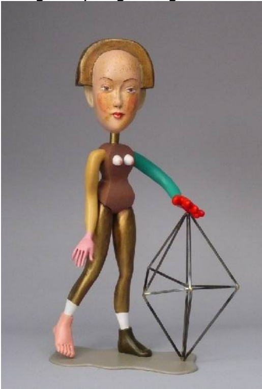
L'architecte , inted bronze, edition of 8

French painter and sculptor, born in 1936, Pierre Dessons has been recognized on the international art scene for the last 50 years. His deeply poetic expression unravels in ambiguously magical figures.