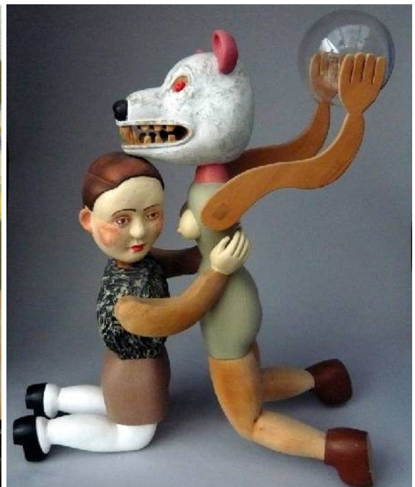
Maman, je t'aime , painted wood and glasse.